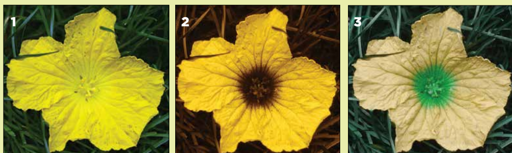
1) Human view. 2) Ultraviolet. 3) Emulates insect vision: visible light with reduced red light, combined with ultraviolet.

Bee expert Zachary Huang applies his skill as a photographer to his science. Here he's shared with us a comparison of one flower filtered to show human vision, ultra-violet and insect vision. Zach says, "Bugs always see a better picture than us!"